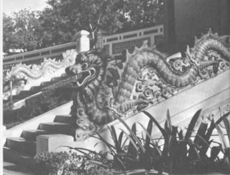
Dragons guard war memorial entrance in Saigon.

and often the design includes bats or butterflies in the corners of the rug to signify happiness.