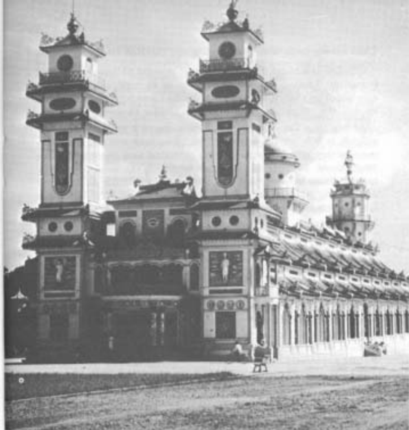
This elaborate Cao Dai temple is near Tay Ninh.

New Religions. In addition to the religions and philosophies brought to Vietnam from other countries, new ones were developed there.