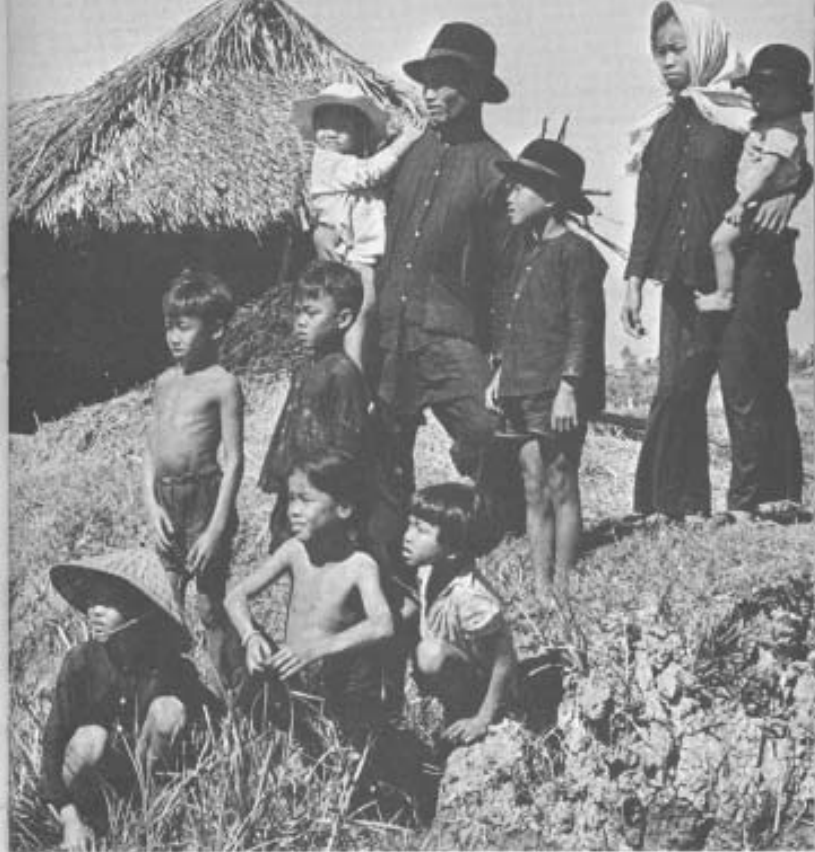
Portrait of a Vietnamese farmer and his family.

The traditional family unit includes living and dead members and members not yet born. On festival days and in family ceremonies the ancestors are revered, and at all times there is thought of the grandsons and great-grandsons yet to be born who will carry