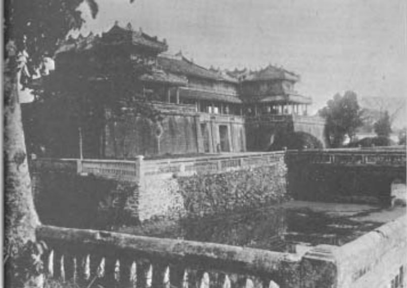
The former imperial Palace in Hué.

The Government has restored a few of the buildings. You can see the Emperor's Audience Hall with its gilt throne and red, dragon-